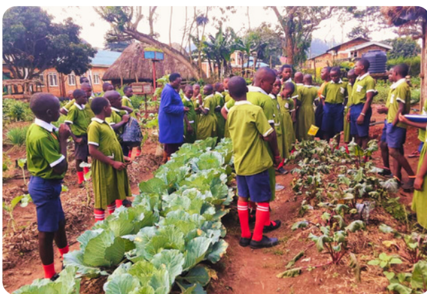
Pupils of Rugashari public primary school on an exchange visit at URDT Demo Farm