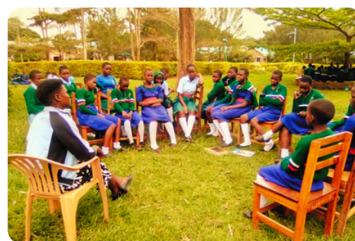
Learners at URDT Girls primary school Kanywamiyaga