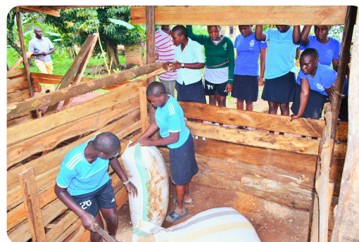
Learners filling saw dust in the pigsty