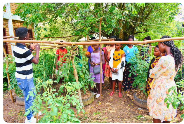
ARU Students Learning Modern Techniques of Tomato Growing

Learners from both higher and lower institutions are visiting the Uganda Rural Development and Training Programme (URDT) to acquire hands-on skills in modern sustainable agriculture. These practical techniques are enabling them to transform their homes and workplaces into models of sustainable agricultural practices, fostering real-world impact and improved livelihoods.